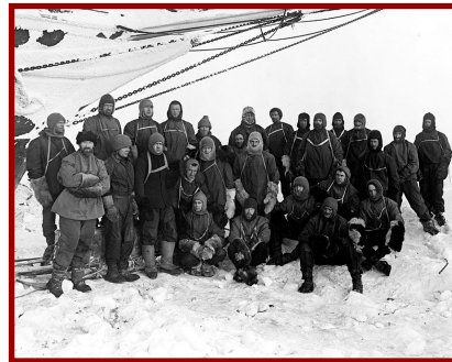
“We knew you’d come back.” – The men who waited for 4 months on Elephant Island.

As you contemplate the meaning behind that message, I thought you might enjoy some “Endurance” photos and a