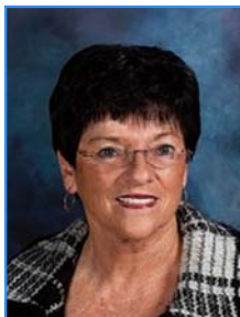
Ginnie Snyder Mapleton Elementary