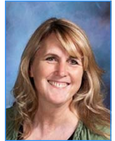
Kalani Reed Canyon Elementary