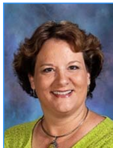
Michele Waite Larsen Elementary