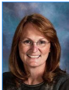
Lois Lundgren Park View Elementary