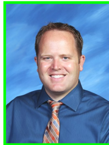
Cory Mendenhall Transportation