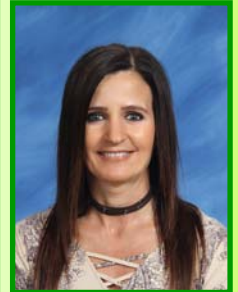
Tracy Haskell Special Education Services