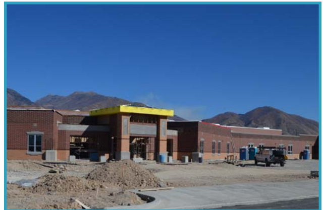
Maple Ridge Elementary will be completed for Fall 2015

Park View Elementary starts Student Journalism Club.