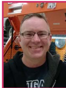
James May Transportation